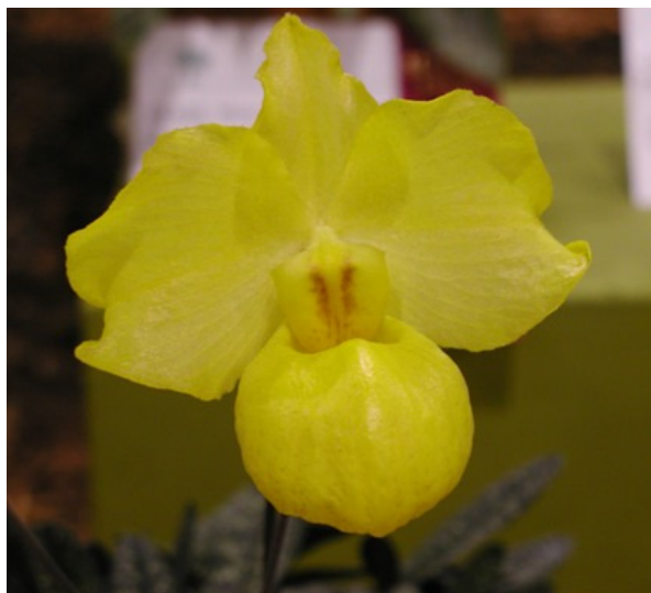
Paphiopedilum armeniacum Grown by Bayard Saraduke

Orchid shows are very popular in the spring. Some of the biggest and most spectacular of them are held now. Check out the list at the American Orchid Society site and see if there is one in your area. Looking at the exhibits you can see what people are growing in your area and local members will be all over to answer your questions about growing. Many times, it is also possible to learn about the local vendors, where they are located, and what kind of plants they have to offer. Most shows have vendors with lots of flowering plants so you can see what you are getting.