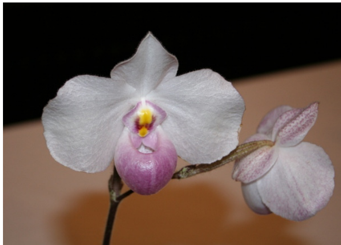
Paphiopedilum delenatii Grown by Ty Triplett