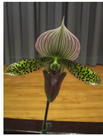
Paphiopedilum Hybrid Grown by Nellie Novak