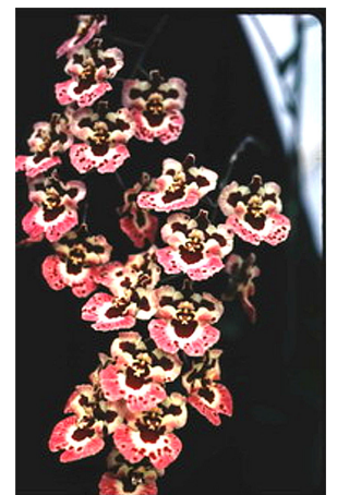
Tolu. Sundown Reef 'The Hollow' HCC/AOS