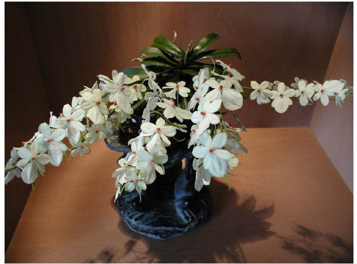
Aerangis luteoalba var. rhodosticta

We are pleased to welcome Ty Triplett at our February 2nd meeting. Ty will be taking us on a walkthrough of the genus Aerangis with some highlights of the genus, including its history, geography, variability of species, awarded clones, and some of its hybrids.