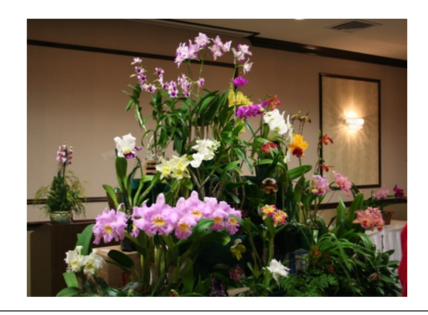
Michael Bowell of Create-a-Scene in Malvern, PA, used plants brought in for the show tables by members of both SJOS and POS to demonstrate how to create an orchid display.