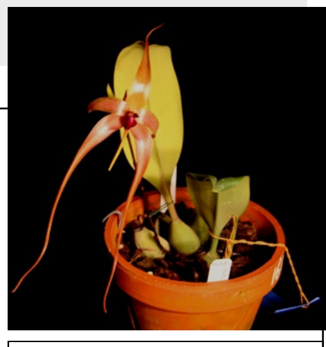
Bulbophyllum echinolabium Grown by Delores & George Benson November Show Table