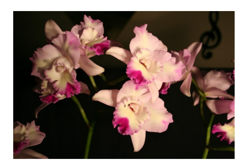
Laeliocattleya Angel Heart 'Hihimanuu' Grown by Sariel Ablaza November Show Table

Show Table plants, along with their completed Show Table slips, must be on the Show Tables by 7:30 sharp in order to be eligible for judging!