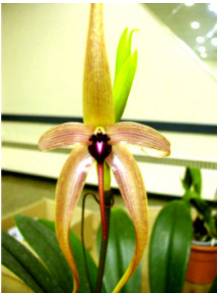
Bulbophyllum echinolabium Open Table