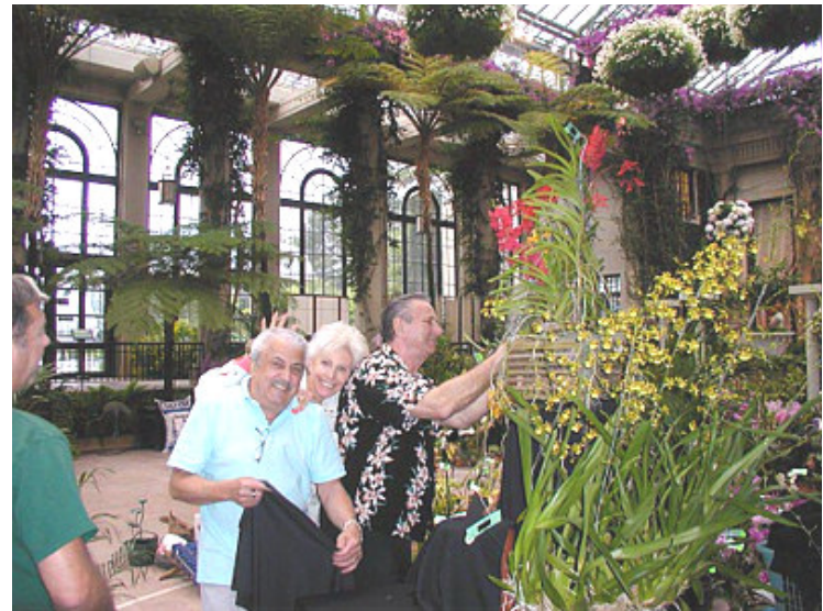
What better backdrop for an orchid exhibit than the beautiful conservatories at Longwood Gardens! Now, back to work!