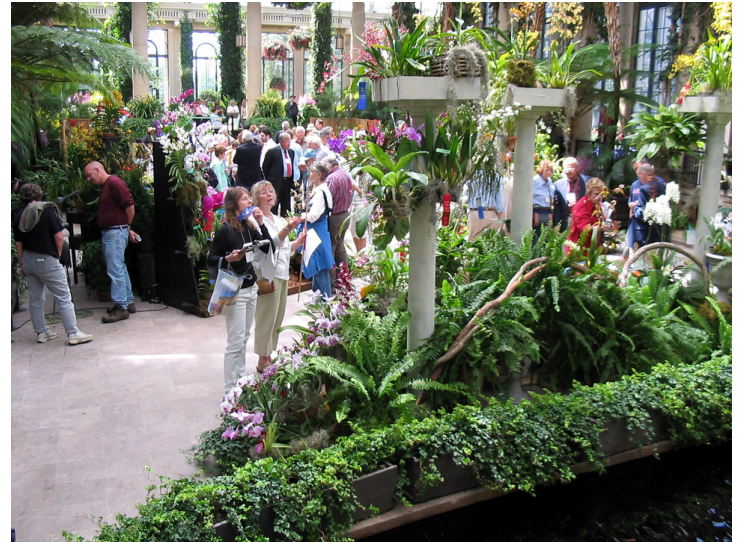
Ribbon clerks in action. Did they have to award the one way up there ???