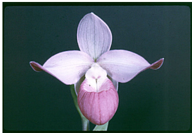
Phrag. schlimii 'Nancy'