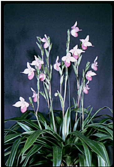
Phrag. schlimii 'Birchwood' CCM/AOS

I water very early on sunny days, perhaps 2-3 times per week in the summer and maybe once a week during the colder winter months. Always be on guard, DO NOT leave moisture in the axles. Moisture combined with cold night temperatures may cause problems. Just a side note here, phrags are never really dormant. You may water them freely throughout the year. I also separate all of my orchids by pot size (I use plastic pots) and can tell when a plant needs watering by the pot weight. In other genera, this works very well and there tends to be no over- or under-watering occurring. The phrags seem to take a little more water than other orchids, but I do not keep them "dripping" or "soggy." However, I am growing each in a small plastic saucer of water, being sure the water level does not completely cover the drainage holes at the bottom sides of the pot, since I believe the roots need both moisture and air.