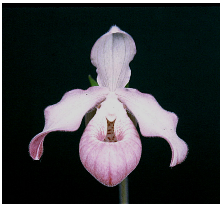
Phrag. Coral Jewel ( sargentianum x schlimii )