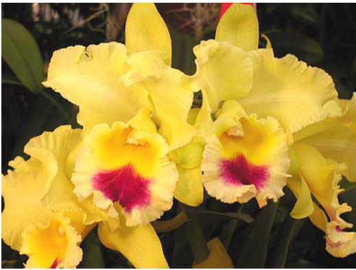
Blc. Goldenzelle 'Lemon Chiffon' AM/AOS 1st Place—Bayard Saraduke