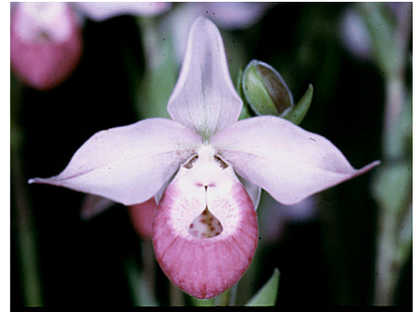
Phrag. schlimii 'Birchwood' CCM/AOS

Well, as promised, I'm back to discuss some important particulars, that is, how I grow them. I should add that if you already grow phrags successfully, please do not dramatically change your culture, but perhaps you might glean a few pointers that may help you to improve your growing. You've heard the old saying, "If it works, don't fix it."