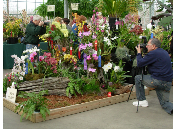
Silva Orchids' Exhibit at the Deep Cut Orchid Society Show in February

Once again, Deep Cut did an amazing job, taking the "less is more" theory to the max. We were treated to more quality-per-square-foot, in terms of artistry as well as plant material, than many larger shows have offered. With