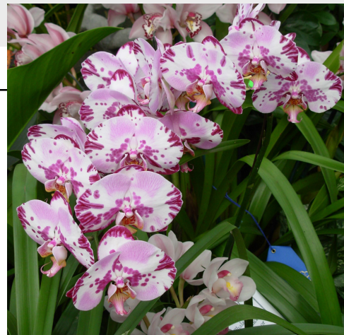
Best Phalaenopsis at the Deep Cut Show