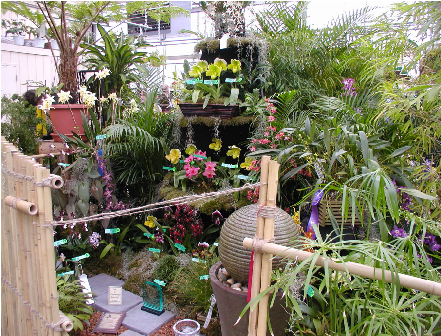
Parkside Orchid Nursery's exhibit at the Deep Cut Orchid Society's Show at Dearborn Market on the weekend of February 6-8.