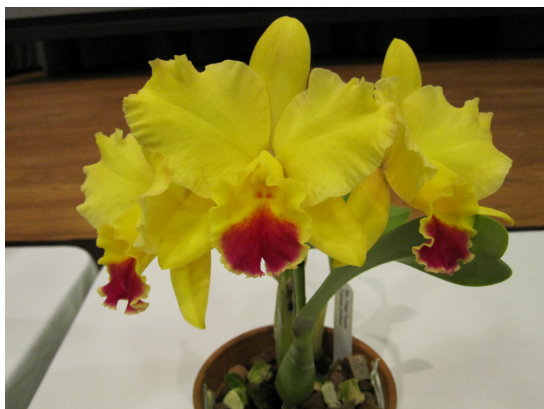
S/c. Final Touch 'Lemon Chiffon' Grown by Bayard Saraduke