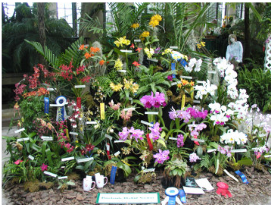
Pinelands Orchid Society Exhibit at Longwood Gardens