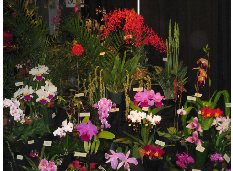
Pinelands' Exhibit at the SEPOS Show