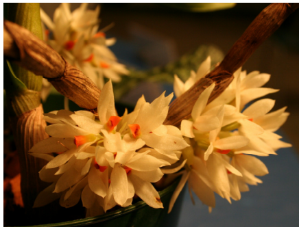
Dendrobium bracteosum Grown by Bayard Saraduke