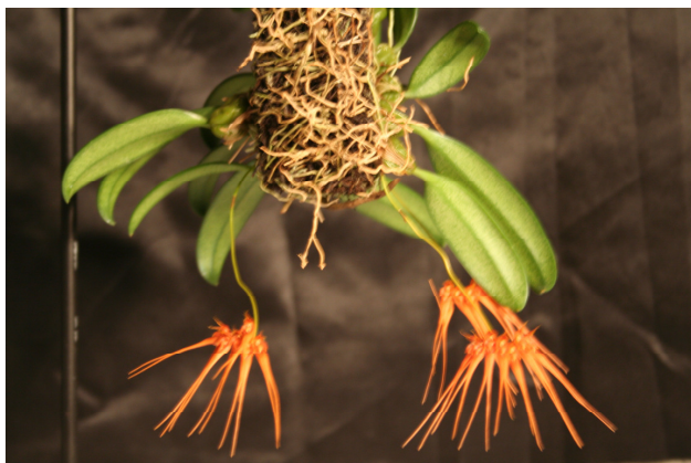
Bulbophyllum tingabarinum Grown by Traci Beden-Tambussi