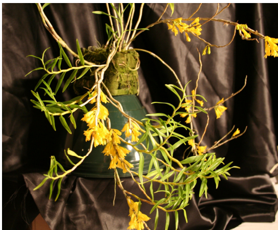
Dendrobium subclausum var. pandanicola Grown by Bayard Saraduke

Show Table plants, along with their completed Show Table slips, must be on the Show Tables by 7:30 sharp in order to be eligible for judging!