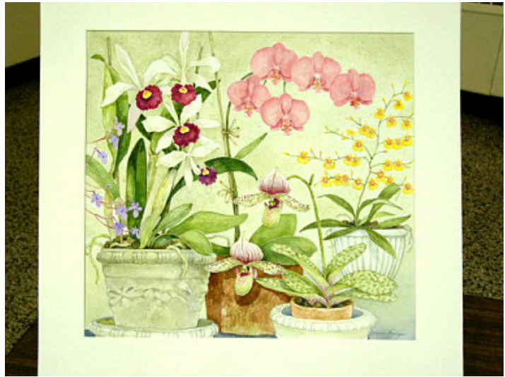
Original watercolor created by Bonnie Heppe Runge for the 2008 Garden Path Calendar