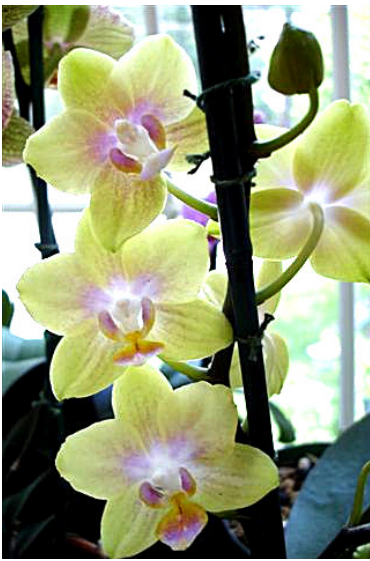
Phal. Gold Tris Pat Eastwood