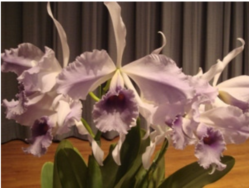
Lc. C. G. Roebling 'Blue Magic' Grown by Bayard Saraduke

* Please note: alcoholic beverages are not permitted at Medford Leas.