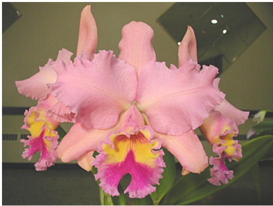
Blc. George King 'Serendipity' AM/AOS Bayard Saraduke