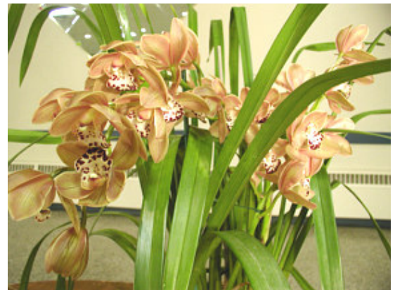
Cymbidium Hybrid Delores Collier