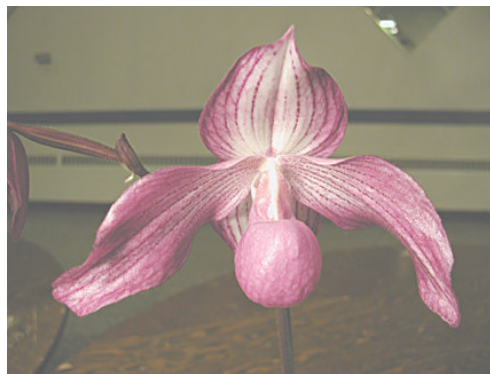
Paph. Pink Sky 'Waterford' HCC/AOS Bayard Saraduke