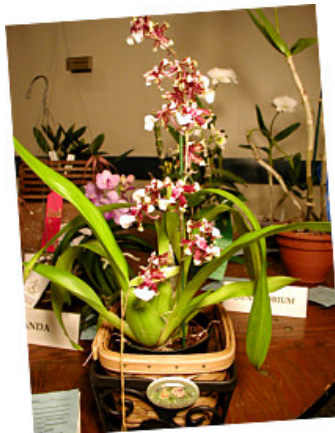
Onc. Starry Night 2nd Prize—Pat Eastwood Novice Table