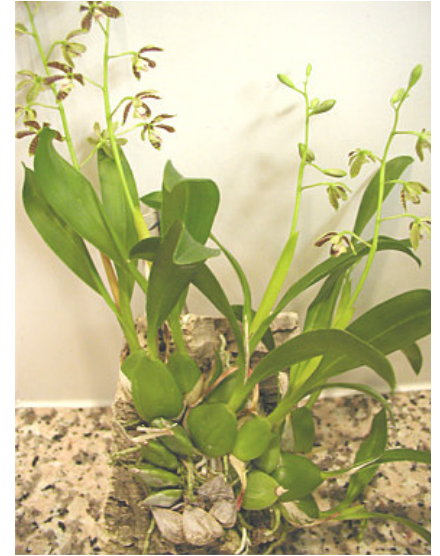
Prosthechea boothiana (Formerly classified as Encyclia boothiana )

The orchid shown in the photo was purchased with a tag that read Encyclia boothiana , but it should be labeled Prosthechea boothiana . The plant has both flattened pseudobulbs and the inflorescences arise from sheaths.