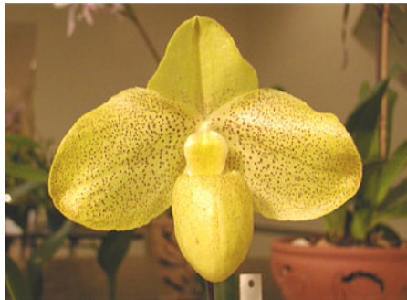
Paph. Fumi's Gold Kathleen Harvey