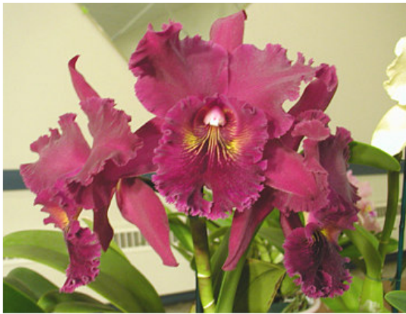
Blc. Chia Lin 'New City' Bayard Saraduke Best of Table