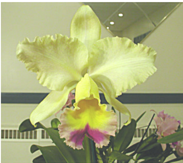
Blc. Goldenzelle 'Prelude' Bayard Saraduke