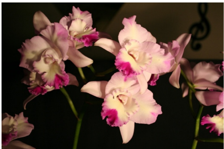
Laeliocattleya Angel Heart 'Hihimanuu' Grown by Sariel Ablaza November Show Table