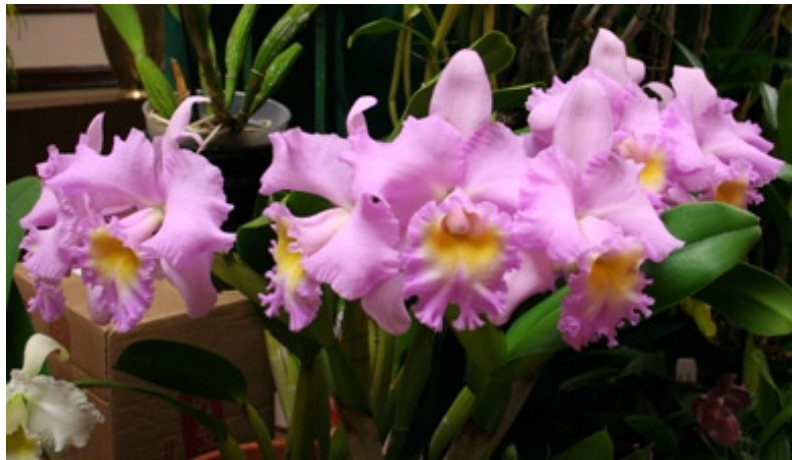
Brassocattleya Princess Teresa 'Princess Michika'