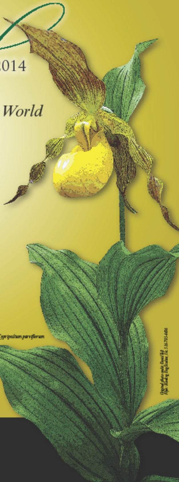
Native Long Island (rare) Cypripedium parviflorum

longislandorchidsociety.org or plantingfields.org