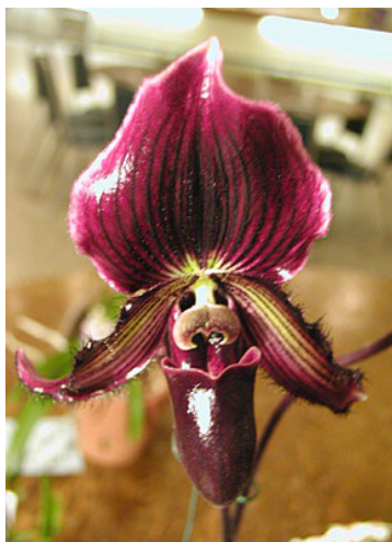
Paph. (Pulsar x Black Cherry) #1 x fairrieanum Super Red 1st Prize – Donna Boyle