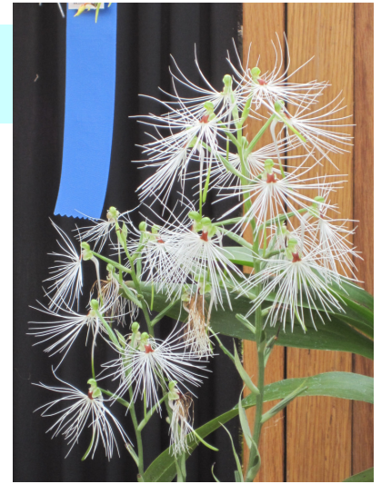
At the Susquehanna Orchid Society Show: Habenaria medusae