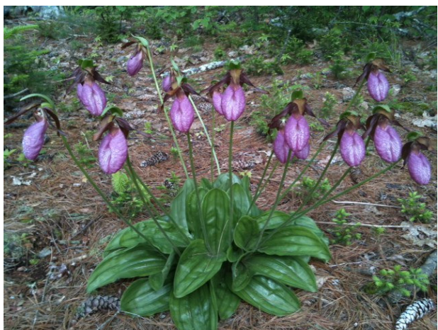
Nature does it best: Slipper orchid growing in situ Boothbay Harbor, Maine, Botanical Gardens